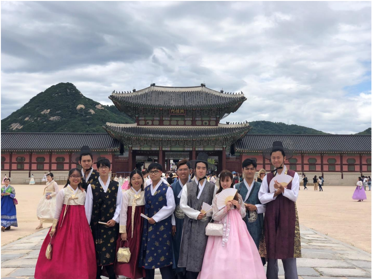
Picture 1. FPT University students in an exchange program in Seoul, Korea

In addition to the cost and content of the program, the diversity of the program is also a big issue. According to Mills et al. (2010), the diversity of programs will greatly help in promoting students to participate in study abroad programs, and in this case, it needs to be taken into account by universities. Study abroad programs span students' four years of study, with many different semesters, further diversifying their options. Because beyond the cost issue, a student may not be able to participate in the program because the time is not suitable for the student due to personal problems or does not match the particular study path of the student. This diversity can also be referred to as the diversity of destinations for programs. The same program content, but we also need to organize it in many different partner units in many different countries. This diversity will enrich students' opportunities to study abroad because there are many different costs, including fees suitable for each family's budget. In addition, a